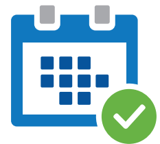
Simpler bus schedules