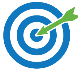
Same frequency all-day, seven-days-a-week